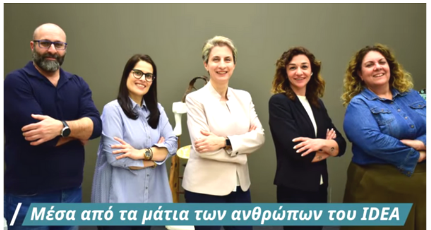
Μέσα από τα μάτια των ανθρώπων του IDEA

An impressive interest received this year as well, for our new call, from young people who aspire to do their own business! 167 applications from 3 continents, 23 presentations, 12 new teams! Our 6th cycle is about to be launched with new fascinating startups and our team is eager to pave with them the road to success. Listen here the IDEA team testimony!